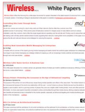
DEDICATED EMAIL BLASTS